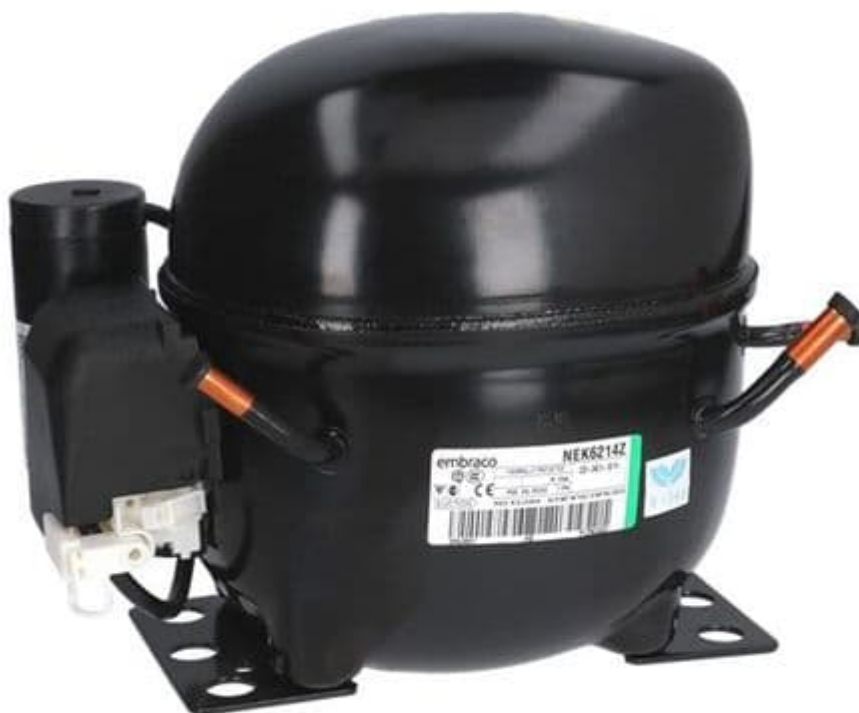
Aspera / Embraco NEK6214Z Refrigeration Compressor R134a HMBP 16.8CC 1/2Hp Tubed 240V~50Hz