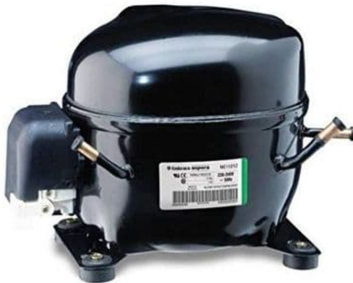
Aspera / Embraco NEK2130Z Refrigeration Compressor R134a LBP 12.12CC 3/8Hp Tubed 240V~50Hz