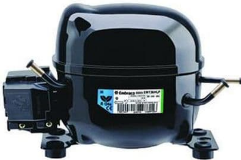
Aspera / Embraco EMT6160Z Refrigeration Compressor R134a HMBP 6.76CC 1/5Hp Tubed 240V~50Hz