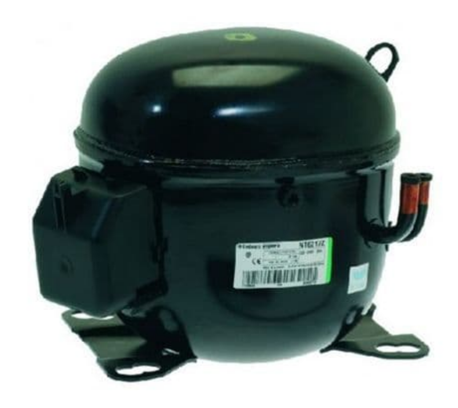
<u>Aspera / Embraco NT6217Z Refrigeration Compressor R134a HMBP 20.4CC 5/8Hp Tubed 240V~50Hz</u>